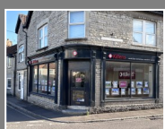
Somerton t. 01458 397000